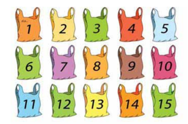
NÃO FAZ SENTIDO. REUTILIZE. USE O MESMO TODOS OS DIAS.