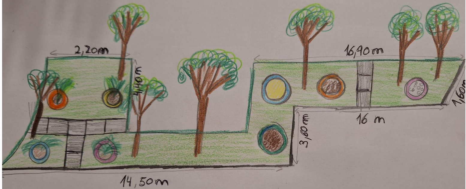
ESPAÇO 1 - ENTRADA